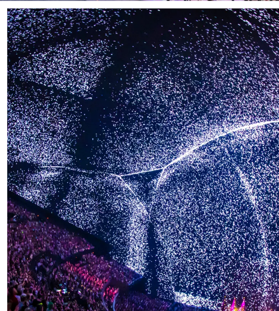
Inside Sphere Las Vegas

Abu Dhabi is preparing to welcome one of the world's most groundbreaking entertainment venues with the upcoming Sphere Abu Dhabi on Yas Island. Set to become the second Sphere destination globally, this futuristic 20,000-capacity landmark is set to redefine live entertainment through cutting-edge technology, immersive visuals, and next-generation multisensory experiences unlike anything previously seen in the region. Strategically located between SeaWorld Abu Dhabi and Yas Mall, the iconic venue, expected to open by 2029, will host spectacular concerts, immersive Sphere Experiences, major sporting events, conferences, and large-scale productions within its state-of-the-art arena. Designed to elevate entertainment and innovation, Sphere Abu Dhabi is geared to become a transformative addition to the emirate's ever-evolving leisure landscape. As Yas Island continues to strengthen its position as a leading global entertainment destination, Sphere Abu Dhabi marks another bold milestone in the capital's vision to deliver world-class experiences that seamlessly blend technology, culture, and entertainment on an extraordinary scale.